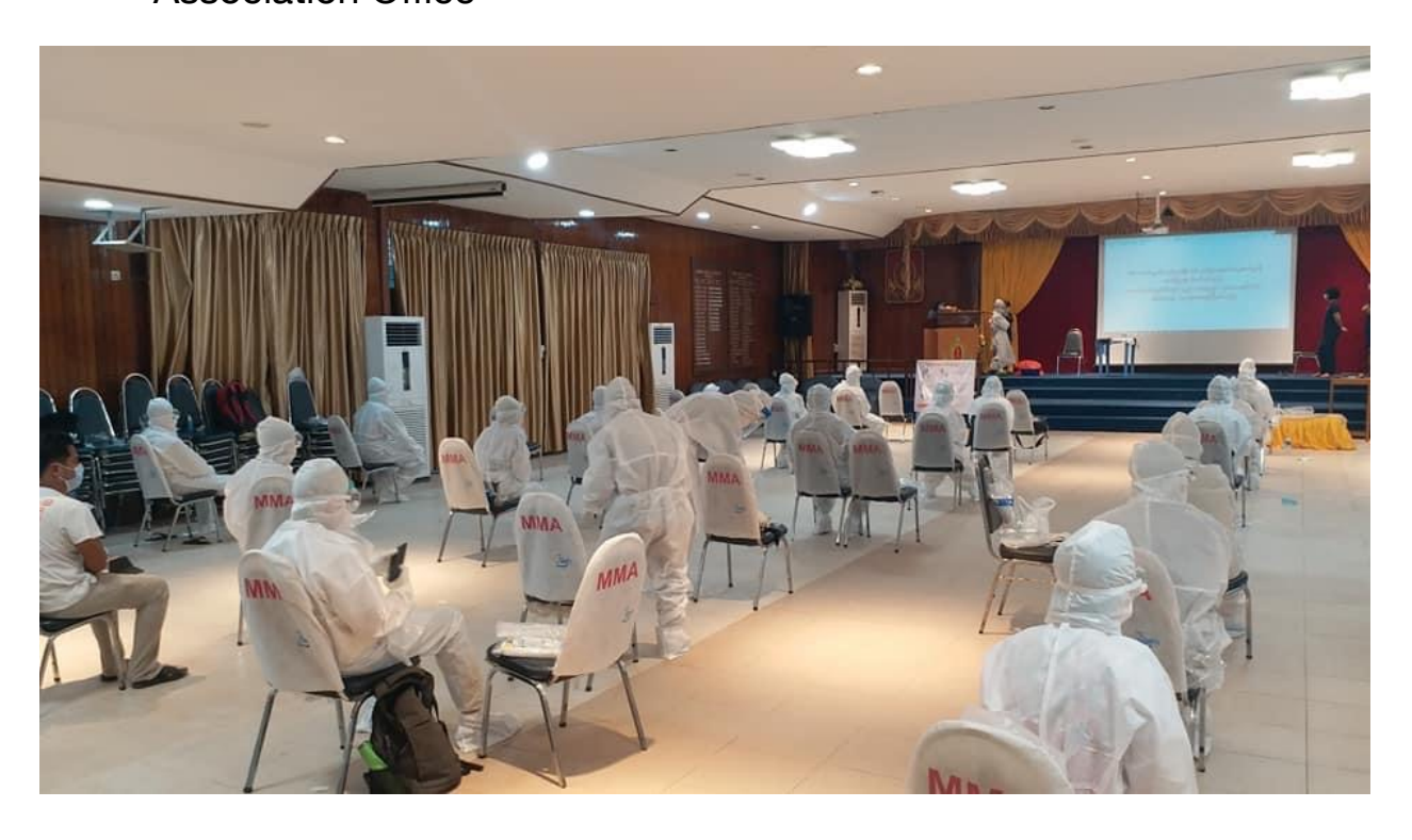
Image 2 Volunteer MOs at Hands on PPE training in Mynamar Medical Association Office